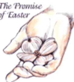
The Promise of Easter

We are worthy; we are worth Jesus' giving his life for us. Instead of explaining all the reasons we don't deserve such a gift, let's just say "thank you" by living for Christ. Nothing could please God more.