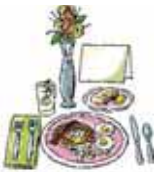
Women's Valentine Breakfast

It is time again to nominate your choice for our annual Woman of the Year award, to be presented at our annual Women's Valentine's Day Breakfast. Ballot forms and a submission box will be in the narthex of the church through Feb. 7. All women and girls of the church are invited to attend free. You may reserve a seat by signing the list in Fellowship