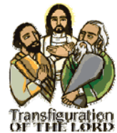
Transfiguration OF THE LORD

Women's Valentine Breakfast 10 a.m. Service Only (No 8:30 Service) Rev. Timothy Haut preaching Exodus 34:29-35 Psalm 99 2 Corinthians 3:12-4:2 Luke 9:28-36, (37-43)